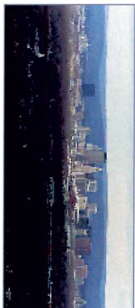
The skyline of Hartford as seen from the scenic vistas at Hollister and Whitehouse preserves

THE KONGSCUT LAND TRUST IS A 28 YEAR OLD NON-PROFIT ORGANIZATION THAT HAS CONSERVED MORE THAN 300 ACRES OF GLASTONBURY LAND FOR THE ENJOYMENT OF FUTURE GENERATIONS THROUGH THE COOPERATIVE EFFORTS OF LANDOWNERS AND THE TRUST