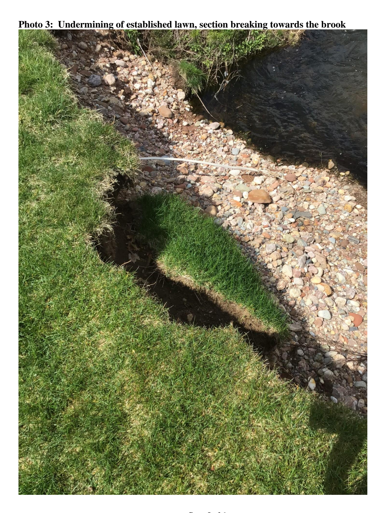
Page 5 of 6