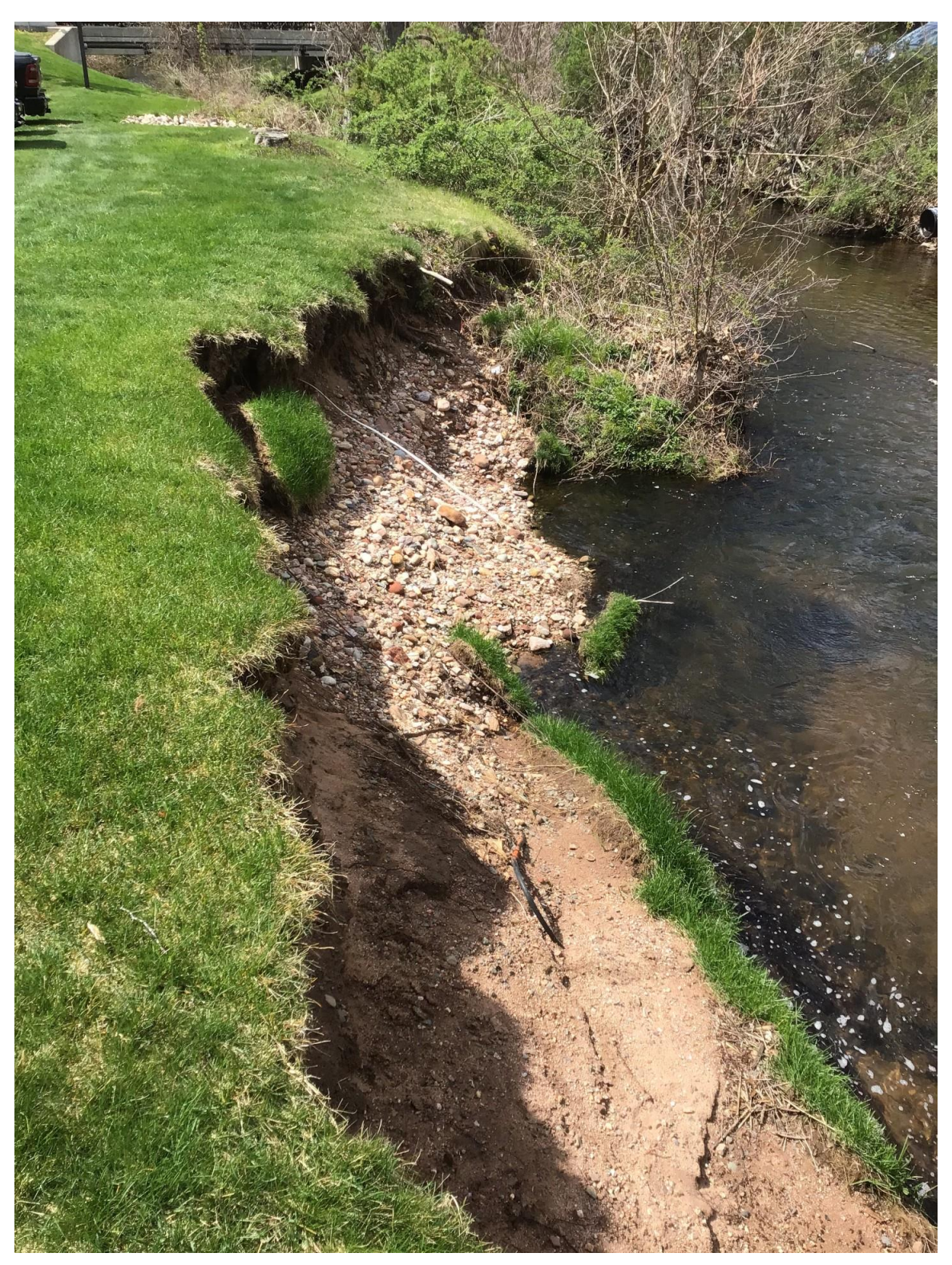
Page 3 of 6