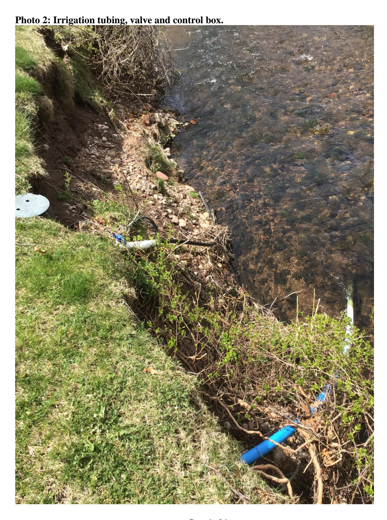
Page 4 of 6