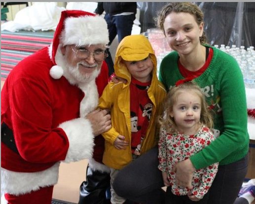
SANTA'S 3.5 MILE RUN Road Race Held in the Winter Anticipated Attendance: 800