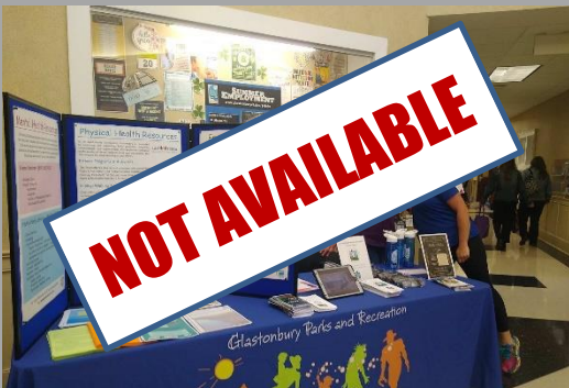
PASSPORT TO HEALTH FAIR Vendor Fair Held in the Spring Anticipated Attendance: 400