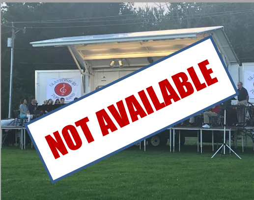
TOWN BAND CONCERTS 4 Concerts Held in the Summer Anticipated Attendance: 800