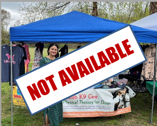
POOCH PROM Vendor Fair Held in the Spring Anticipated Attendance: 400