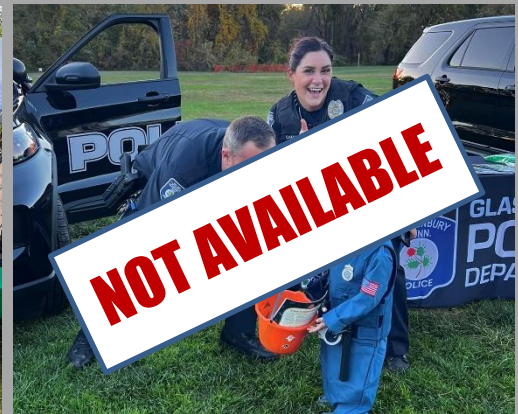
HOMETOWN HEROES Event Held in the Fall of Odd Years Anticipated Attendance: 900