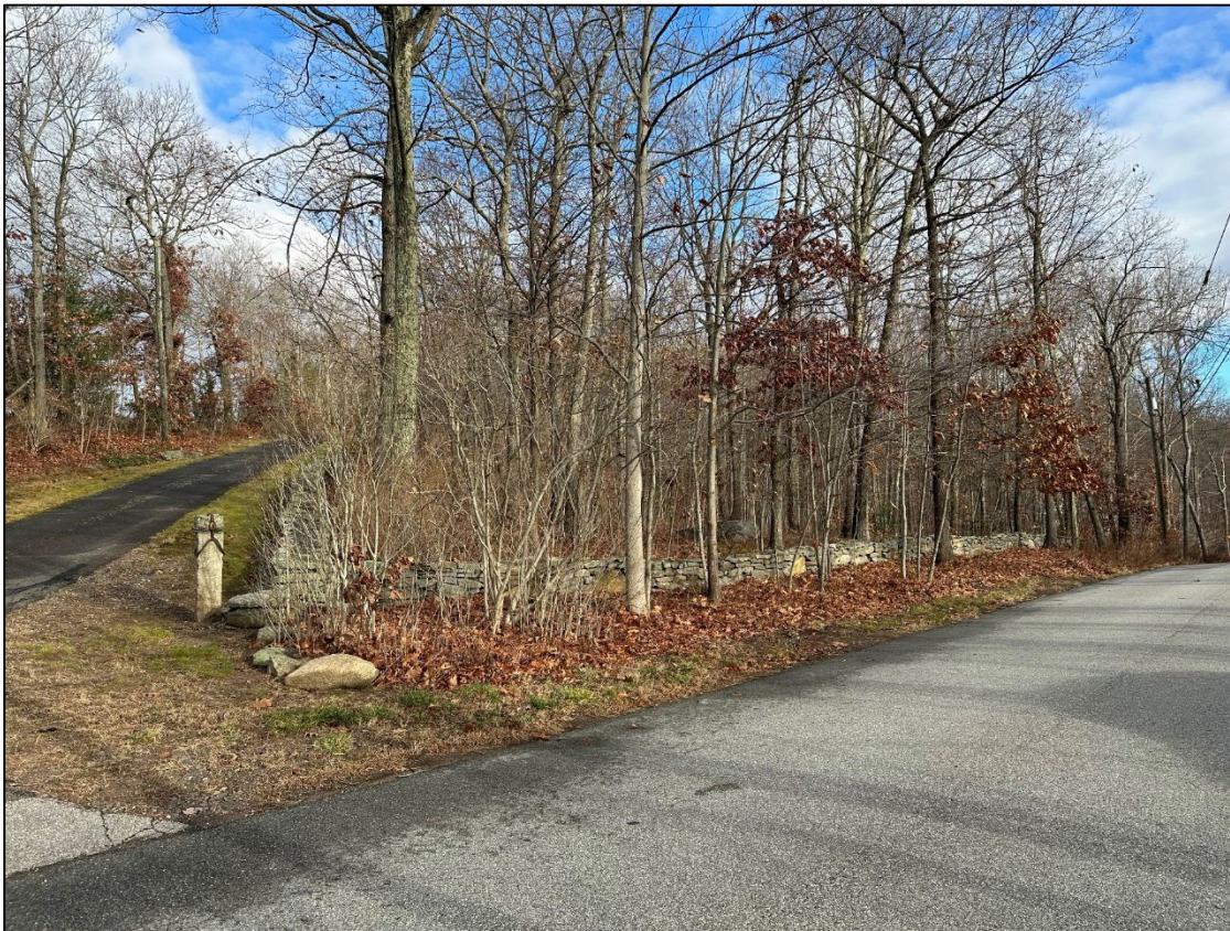
Street view of 395 Country Club Road looking northeast

The proposed lot meets all the bulk and setback requirements for the Rural Residence Zone. The applicant has requested waivers from installation of sidewalks and capped sewers. The Engineering Department has submitted a memorandum on behalf of the Town of Glastonbury Water Pollution Control Authority stating that a waiver for capped sewers is not required. . The applicant intends to preserve at least 3 specimen trees in the Town right-of-way that will fulfill the Subdivision Regulations requirement for street trees in the Rural Residence Zone.