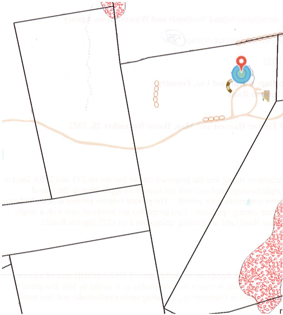
Wetland soils (shown in red) located in northeast corner of unimproved lot 275 Dayton Road. Watercourse connects to wetland soils off site, and runs north/south.