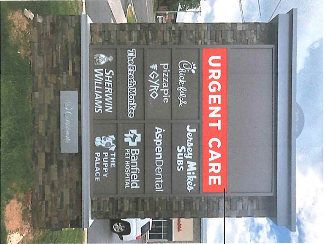
Aluminum face with cut-out text backed up with white acrylic.