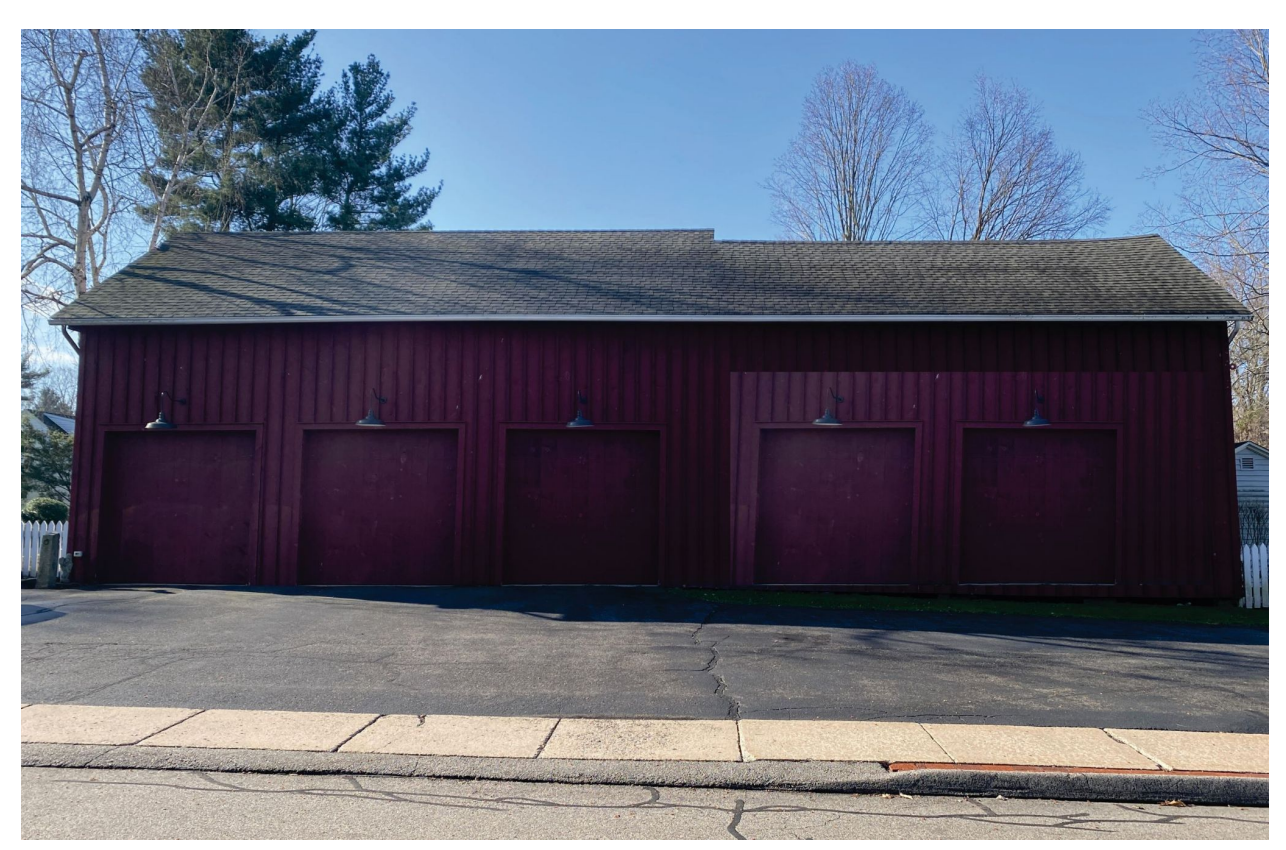
Figure 2: Proposed Alteration

The two new garage doors shown in Figure 2 shall be duplicates of the existing garage doors to maintain a consistent appearance from the street. The exterior will remain the board and batten style.