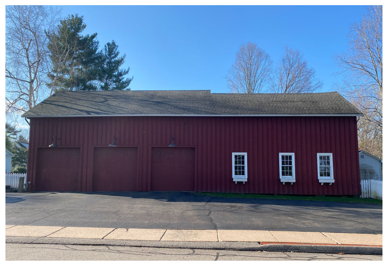
Figure 1: Existing Barn

Figure 1 below shows the barn as it is currently configured and Figure 2 shows the proposed changes.