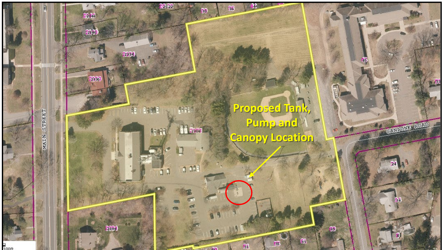
Aerial view of proposal at 2108 Main Street

The proposal is to remove and replace the existing fuel pump and underground fuel tank, located just north of the recently installed solar carports. A new 10,000 gallon above-ground pre-cast concrete fuel tank is proposed, along with fuel pump upgrades to include a 24' by 20' canopy at an overall height similar to the high point of the adjacent solar carports.