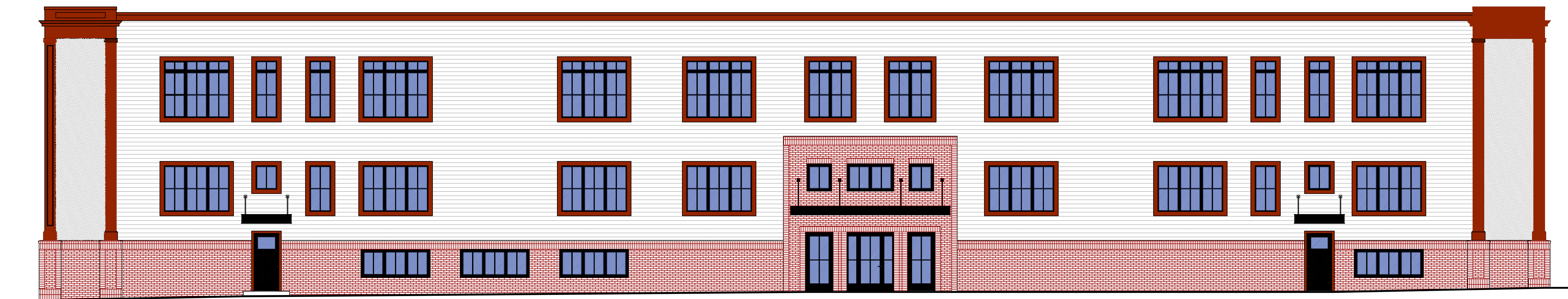
EAST ELEVATION (FROM DRIVEWAY)