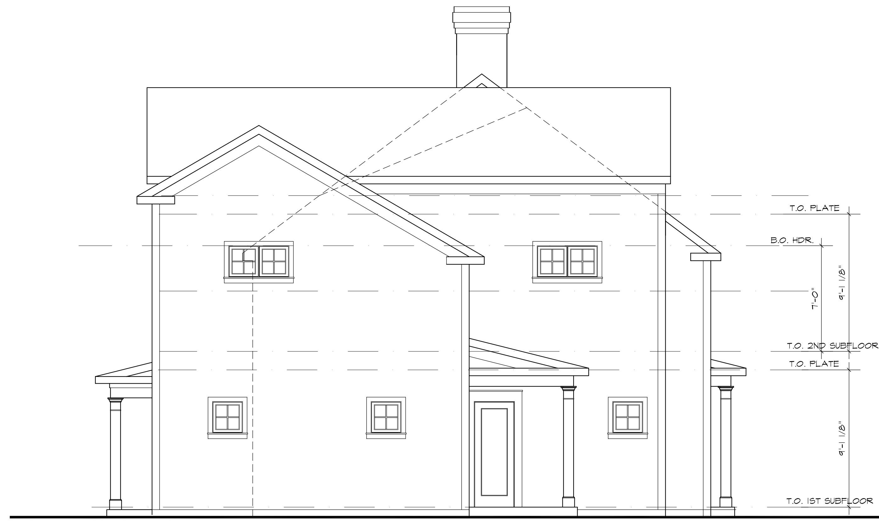
NORTH ELEVATION SCALE: 1/4"=1'-0"