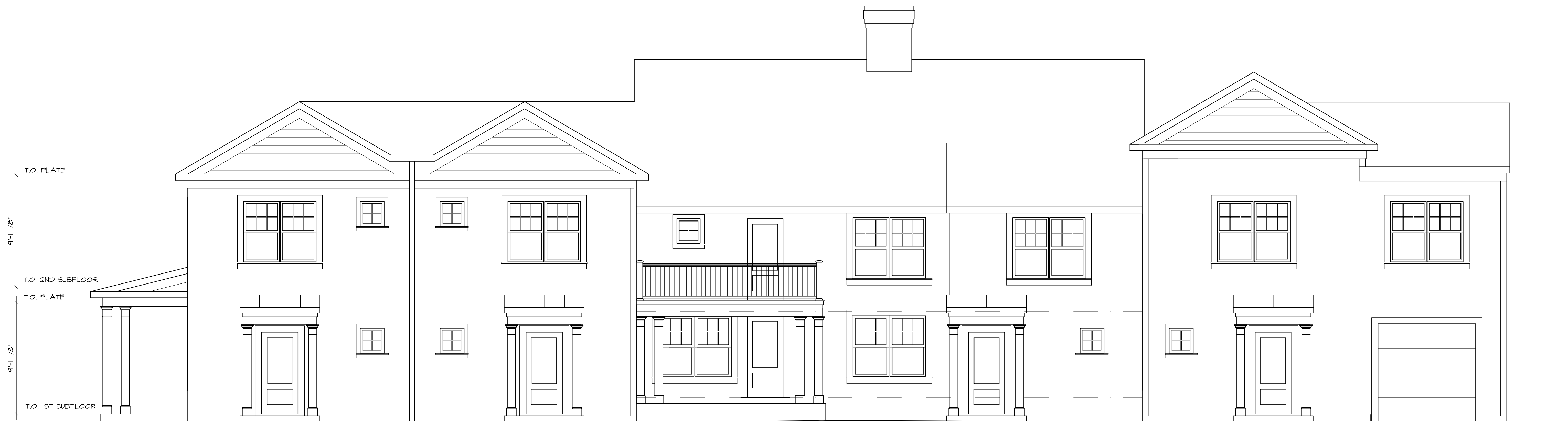
EAST ELEVATION SCALE: 1/4"=1'-0"