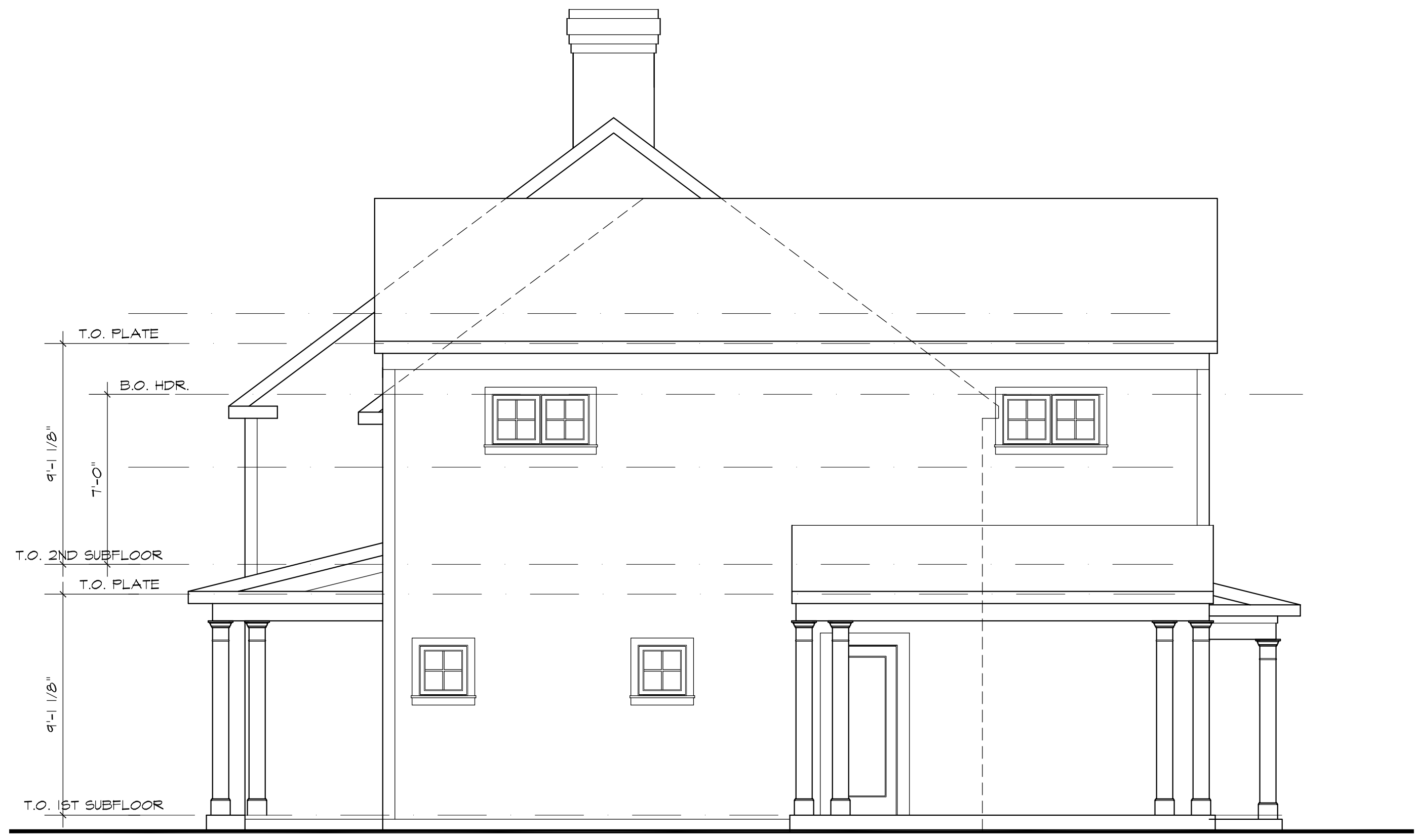
SOUTH ELEVATION SCALE: 1/4"=1'-0"