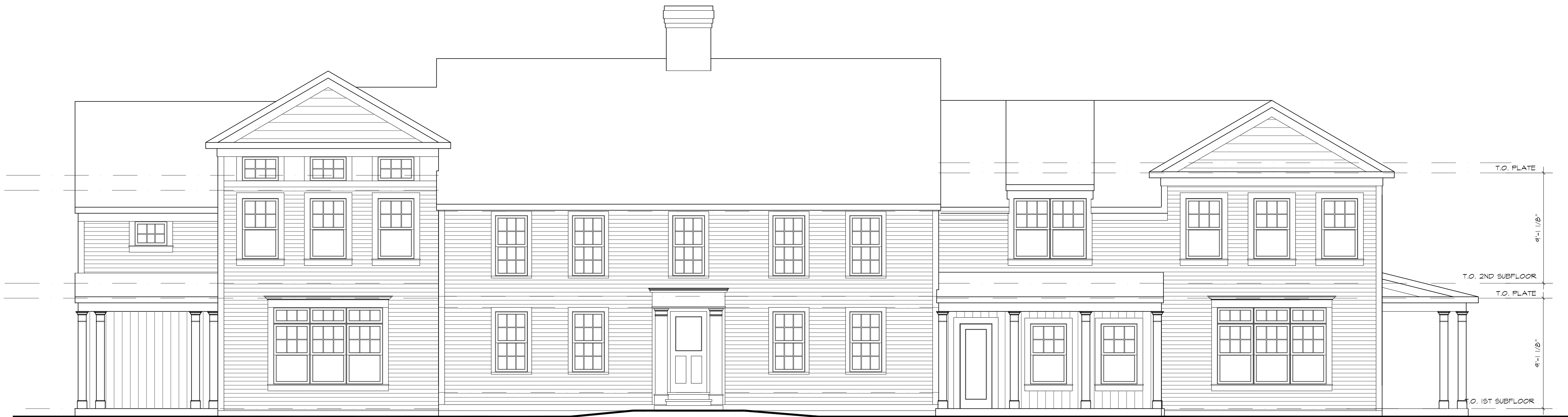
WEST ELEVATION SCALE: 1/4"=1'-0"