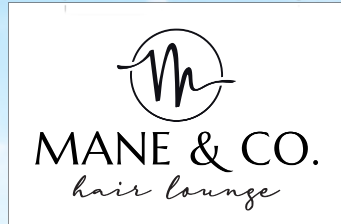
20" x 30" Hanging Sign