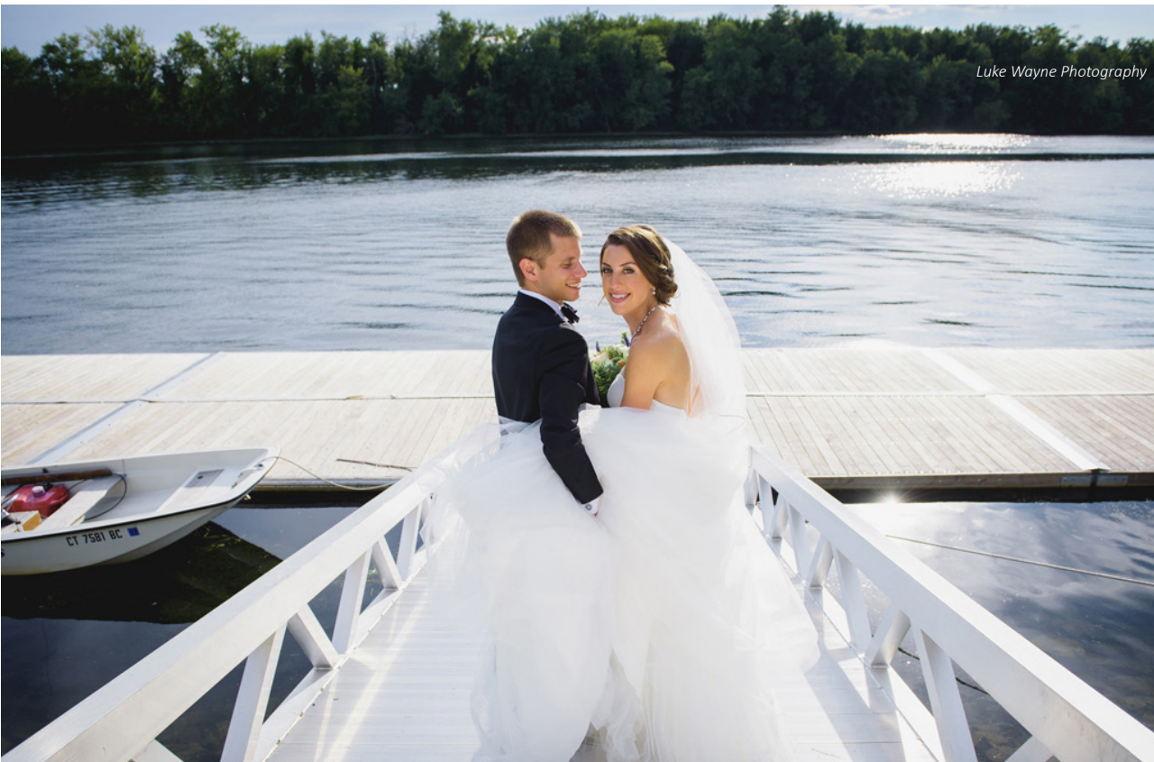
Luke Wayne Photography