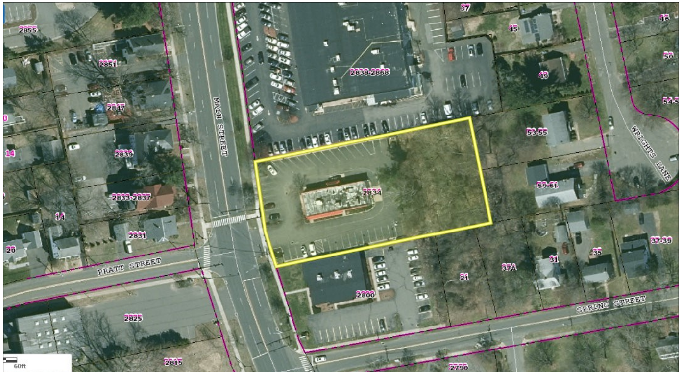
Aerial view of 2855 Main Street looking west