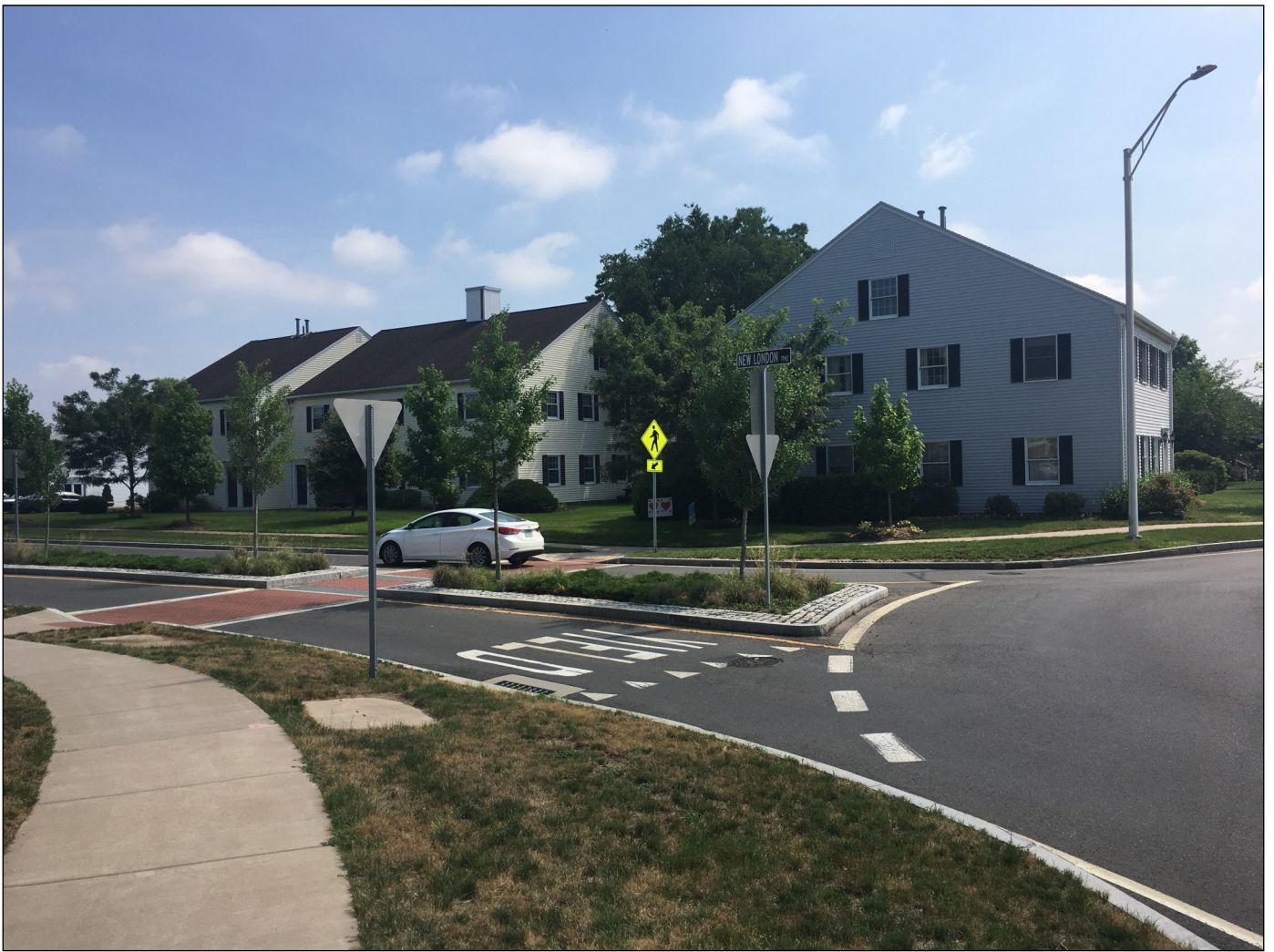
View of site for the proposed building site from the roundabout at Hebron Avenue and New London Turnpike looking north-east