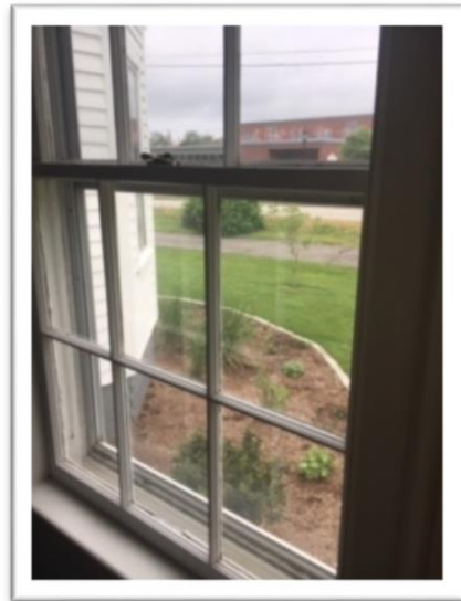
Views of Existing Windows