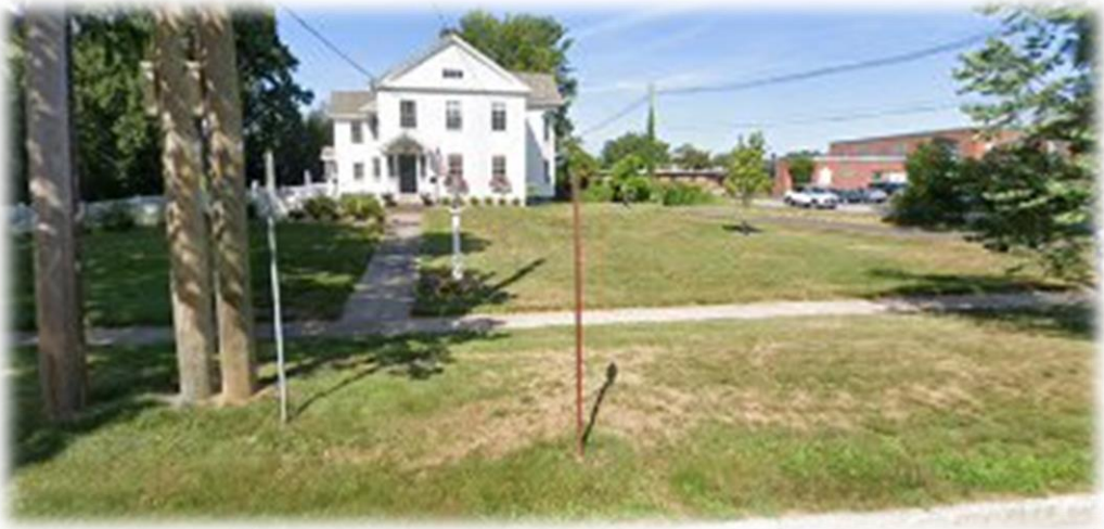
View of property from Main Street facing west