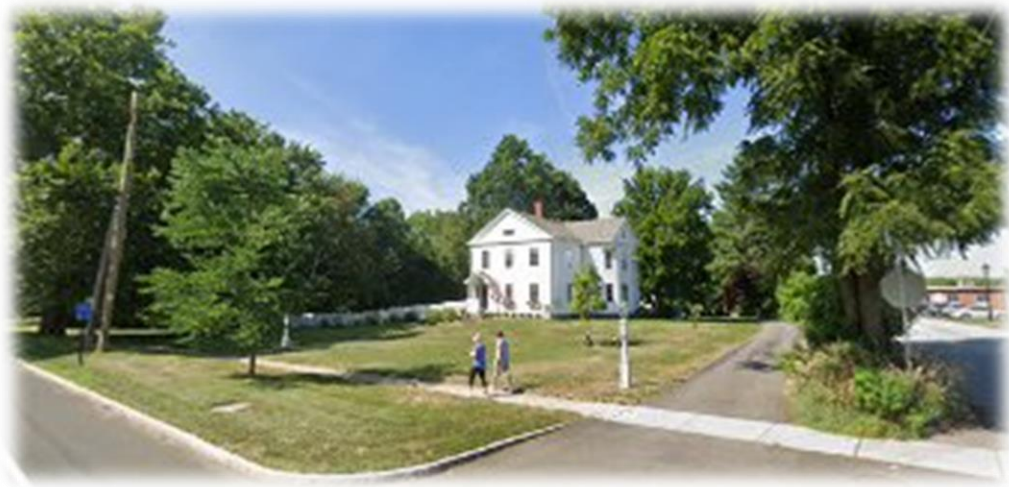
View of property from Main Street facing southwest. Glastonbury Town Hall is directly to the north