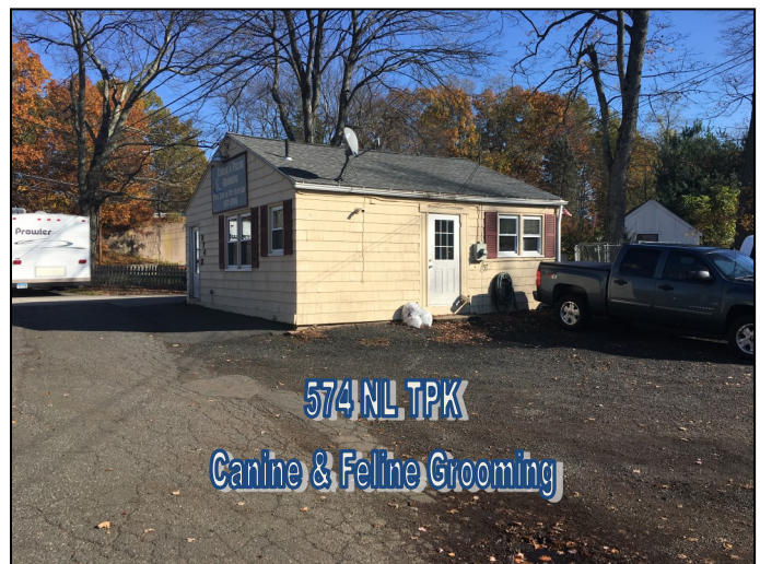
574 NL TPK Canine & Feline Grooming