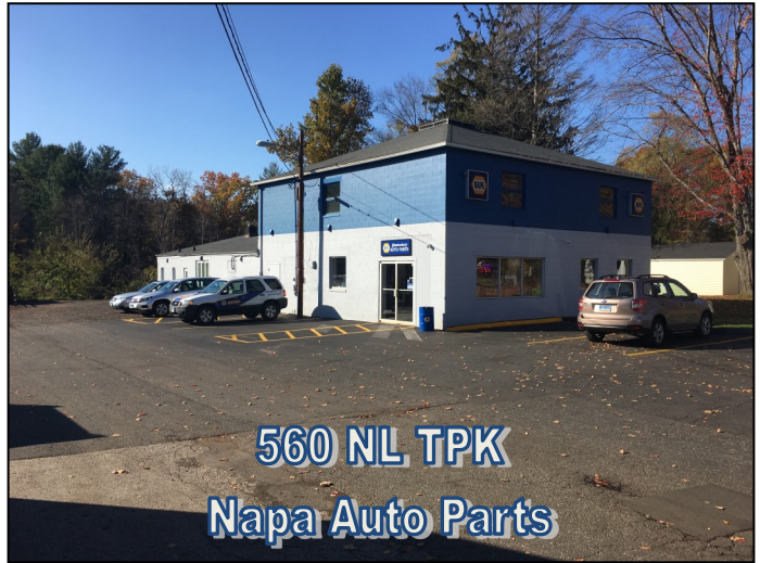
560 NL TPK Napa Auto Parts