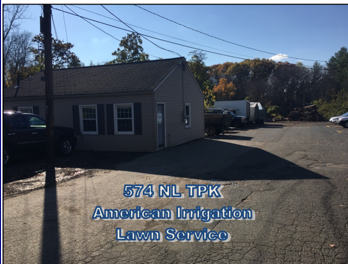
574 NL TPK American Irrigation Lawn Service