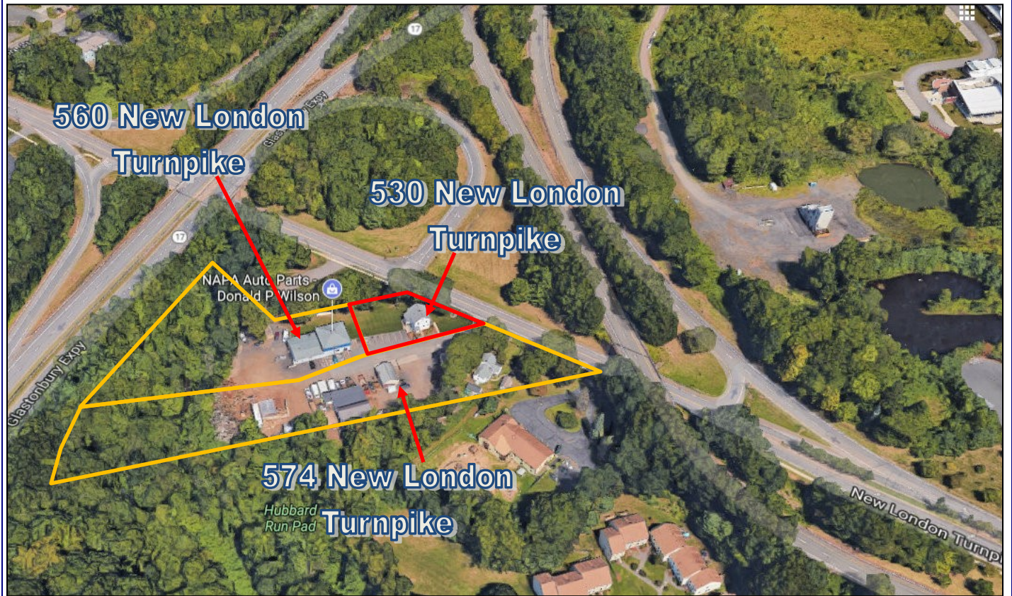
Aerial view of 530 New London Turnpike looking north