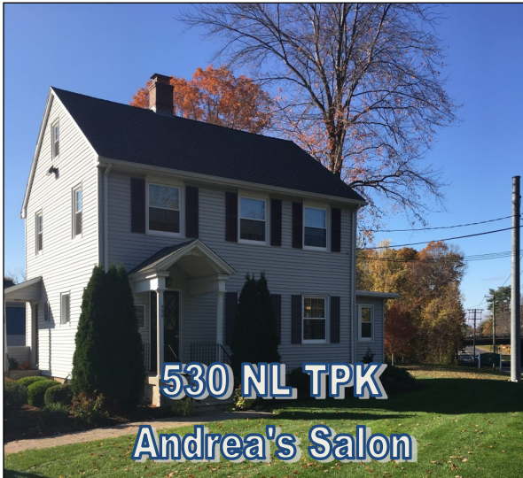
530 NL TPK Andrea's Salon