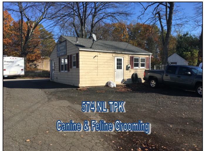
574 NL TPK Canine & Feline Grooming