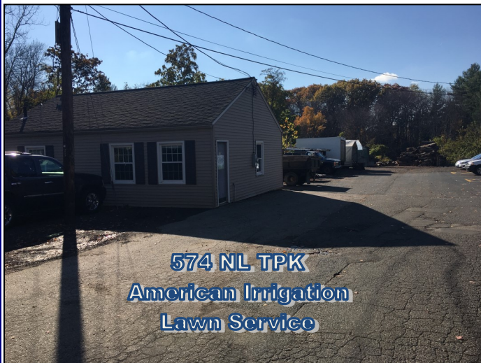
574 NL TPK American Irrigation Lawn Service