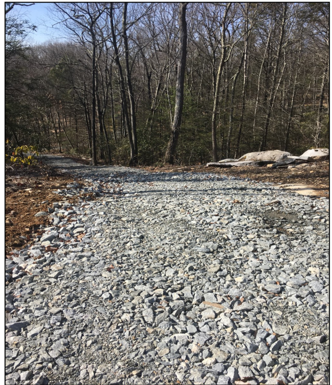
Above left—view from house location looking south Above Right view from house location looking northeast Right— view look southwest down driveway