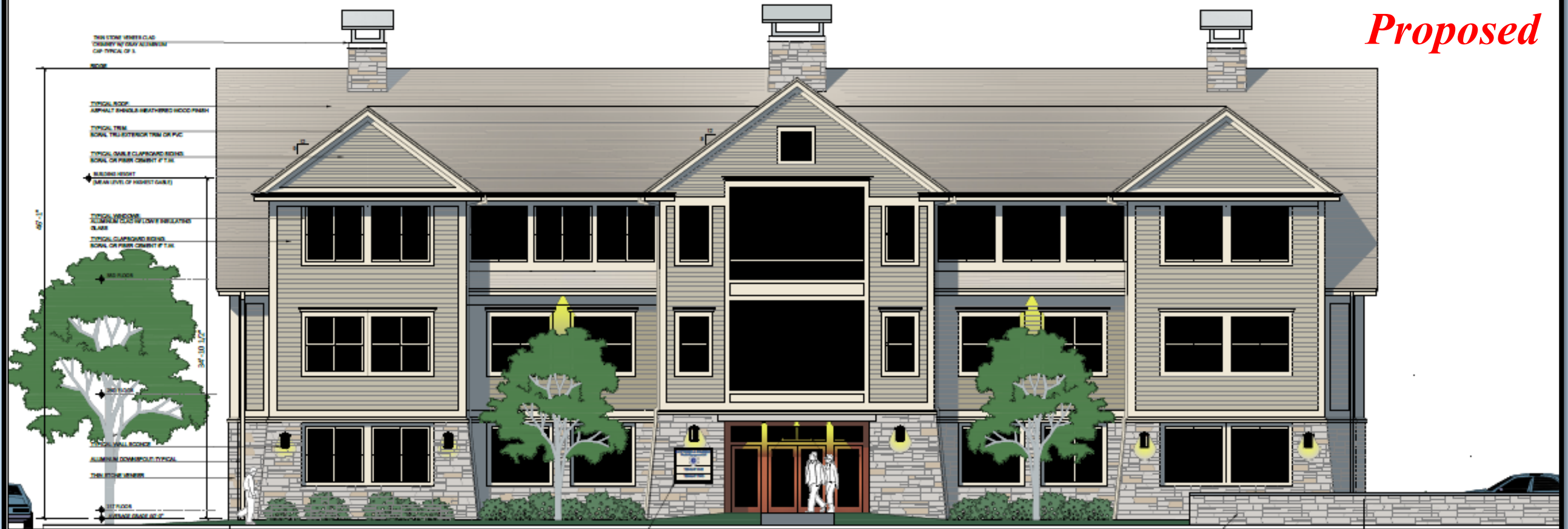
2 PROPOSED NORTH ELEVATION (EYEBROW DORMERS REMOVED) 3/16" = 1'-0"