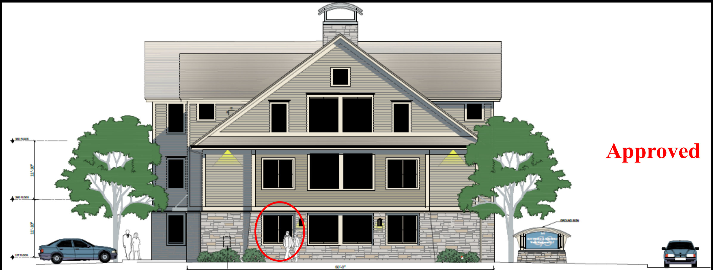
1 APPROVED EAST ELEVATION 3/16" = 1'-0"