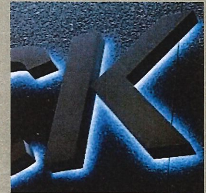
SECTION DETAIL AT LETTERING N.T.S.

*length will vary pending Tenant Copy not to exceed 19sq. ft.