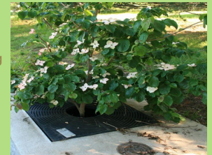
Tree box filter in East Lyme, CT

Tree box filters function similarly to rain gardens; they are placed on or near roads, sidewalks, or parking lots to absorb stormwater runoff. The engineered soil medium helps to improve water quality by removing common pollutants from stormwater before it is absorbed into the soil surrounding the filter. If an intense precipitation event occurs, there is an outflow pipe within the tree box filter that discharges excess water to the town's storm drain system.