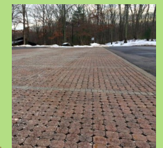
Pavers in Tolland, CT

Pavers come in many different shapes and sizes, but they all function in the same way. While conventional pavement does not allow water to infiltrate, spaces are built into pavers which allows water to be absorbed into the soil, reducing the volume of runoff that comes off of sidewalks, roads, and parking lots. The pavers can be constructed with concrete, brick, stone, plastic, and even recycled glass depending on the volume of traffic expected.