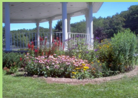
Rain garden in Niantic, CT

Rain gardens are similar to green roofs in that they use soil and vegetation to absorb excess stormwater. However, since rain gardens aren't limited to a rooftop location, they can support a greater variety of vegetation. Though they aren't found on roofs,