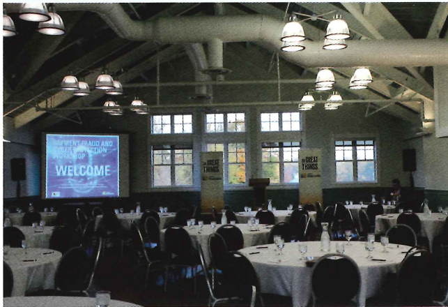
Transform our banquet hall to bring your vision to life!