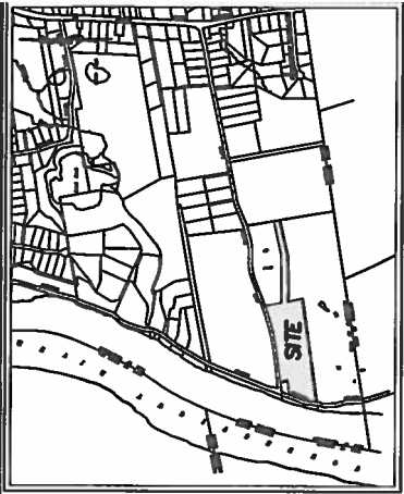
LOCATION MAP SCALE: 1"